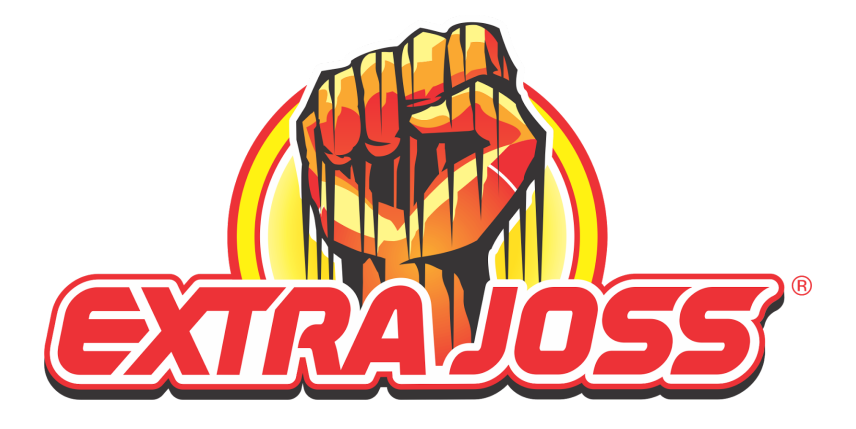
Figure 4. Extra Joss Logo

Extra Joss is one of the best-selling brands in Kalbe, an energy drink in the form of powder. Extra Joss is the first energy drink in powder form in Indonesia which triggered the development of other powder energy drinks (Hemaviton & Kukubima) that later served as a competitor of Extra Joss.