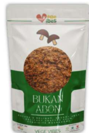
Figure 4. Bukan Abon