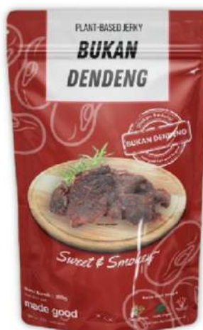
Figure 3. Bukan dendeng

PT. Solusi Nutri Sehat is focusing on developing products with the concept of vegan products with a brand called Vege Vibes. PT. Solusi Nutri Sehat has launched two products under the Vege Vibes brand, namely "Bukan Dendeng" and "Bukan Abon". "Bukan Dendeng" is a product made from soy protein that is processed to resemble commercial jerky. The product has a shelf life of 3 months at room temperature in tightly closed packaging. This product has 2 variants, namely "Spicy and Savory" & "Sweet and Smokey". The second product is "Bukan Abon" which is a product made from shiitake mushroom legs and textured soy protein that is processed to resemble commercial floss. This product has already been sold in e-commerce Made Good Market. PT. Solusi Nutri Sehat is located in Jl. Pilar II No.10, RT.3/RW.3, Kedoya Sel., Kec. Kb. Jeruk, Kota Jakarta Barat, Daerah Khusus Ibukota Jakarta.