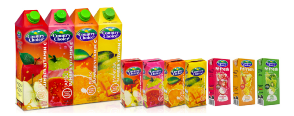
Figure 5. Country Choice products

TEBS brand was an innovative approach that PT Sinar Sosro took in 2004 to provide a fruit flavor carbonated RTD beverage with a tea base, with the aim to attract youthful, expressive, sociable, energetic, and modern consumers. TEBS is packaged in a can (330 mL), returnable glass bottle (230 mL), and polyethylene terephthalate (PET) plastic bottle (500 mL) ( Figure 4 ). It is available in a mixed fruit and lemon lime variant.