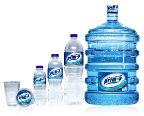
Figure 6. Prima-A products

The Prima-A brand was initially named "Air Sosro", which later changed to "Air Mineral Prima-A" in 1999. The bottled drinking water is available in cup (240 mL), bottle (330 mL, 600 mL, and 1500 mL), and gallon (19 L) (Figure 6).