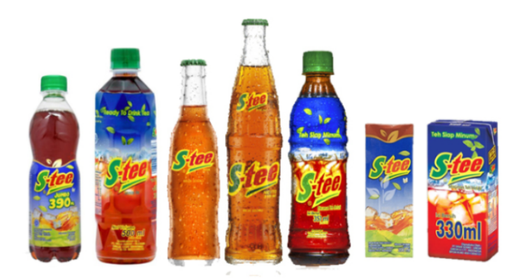
Figure 3. S-Tee products

Fruit tea, ready-to-drink beverage added with fruit flavor, is currently available in nine different variants, including apple, blackcurrant, x-treme (combination of apple and blackcurrant flavors), strawberry, freeze (combination of strawberry, grapes, and cool sensation), guava, yuzu, lemon, and passion fruit. Fruit tea was produced in 1997 and initially packaged on a triangle shaped carton. The packaging was then developed, providing fruit tea with glass bottle (235 mL), polyethylene terephthalate (PET) plastic bottle (350 mL and 500 mL), can (318 mL), tetra pak (200 mL), and pouch (230 mL) packagings (Figure 2).