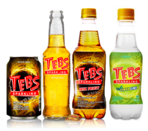
Figure 4. TEBS products

TEBS brand was an innovative approach that PT Sinar Sosro took in 2004 to provide a fruit flavor carbonated RTD beverage with a tea base, with the aim to attract youthful, expressive, sociable, energetic, and modern consumers. TEBS is packaged in a can (330 mL), returnable glass bottle (230 mL), and polyethylene terephthalate (PET) plastic bottle (500 mL) ( Figure 4 ). It is available in a mixed fruit and lemon lime variant.