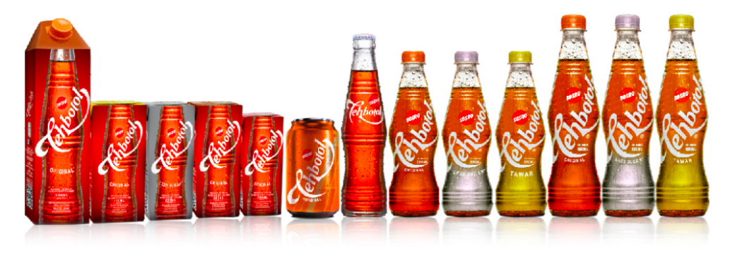
Figure 1. Tehbotol Sosro products

PT Sinar Sosro has developed various beverages, which includes Tehbotol Sosro, Fruit tea, S-Tee, TEBS, Country Choices, and Prim-A. Each of these products has its packaging types, and some have different sugar level variations.