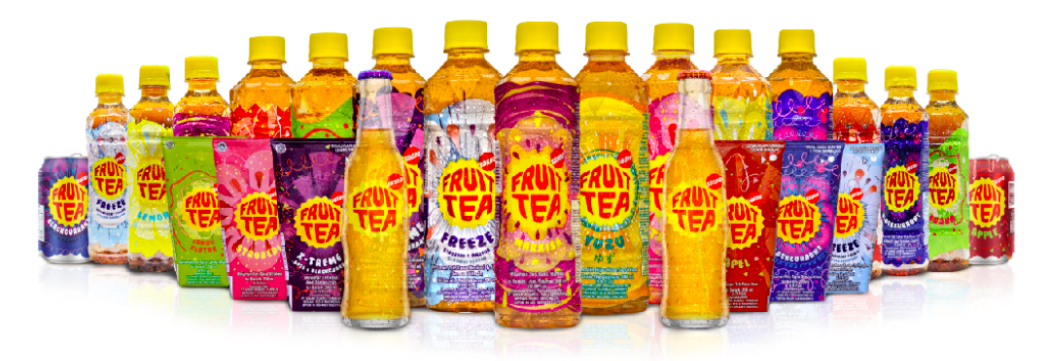
Figure 2. Fruit Tea products

Fruit tea, ready-to-drink beverage added with fruit flavor, is currently available in nine different variants, including apple, blackcurrant, x-treme (combination of apple and blackcurrant flavors), strawberry, freeze (combination of strawberry, grapes, and cool sensation), guava, yuzu, lemon, and passion fruit. Fruit tea was produced in 1997 and initially packaged on a triangle shaped carton. The packaging was then developed, providing fruit tea with glass bottle (235 mL), polyethylene terephthalate (PET) plastic bottle (350 mL and 500 mL), can (318 mL), tetra pak (200 mL), and pouch (230 mL) packagings (Figure 2).