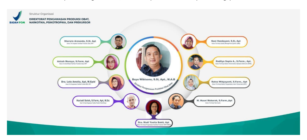
Figure 2. DITWASPROD ONPP structural organization

policies, standard procedures, conduct inspection to production facilities, and set criteria for technical guidance, supervision, and evaluation of drug, narcotics, psychotropics and precursors products. The scope of supervision by DITWASPROD ONPP is the pharmaceutical industry (production of medicinal raw materials, finished medicines with chemical active substances, and local or imported biological products production facilities) and special facilities such as Blood Transfusion Units (BTU), research institutes, stem cell processing facilities, and radiopharmaceutical processing/production facilities.