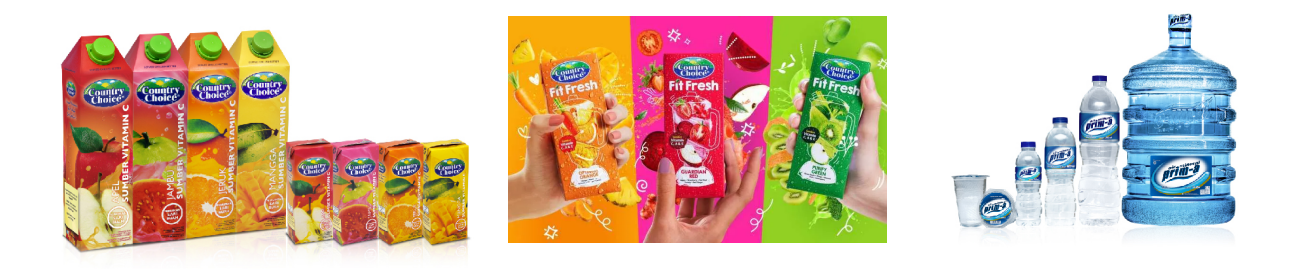
Figure 2. Non Tea-Based Products namely Country Choice and Prim-A Mineral water