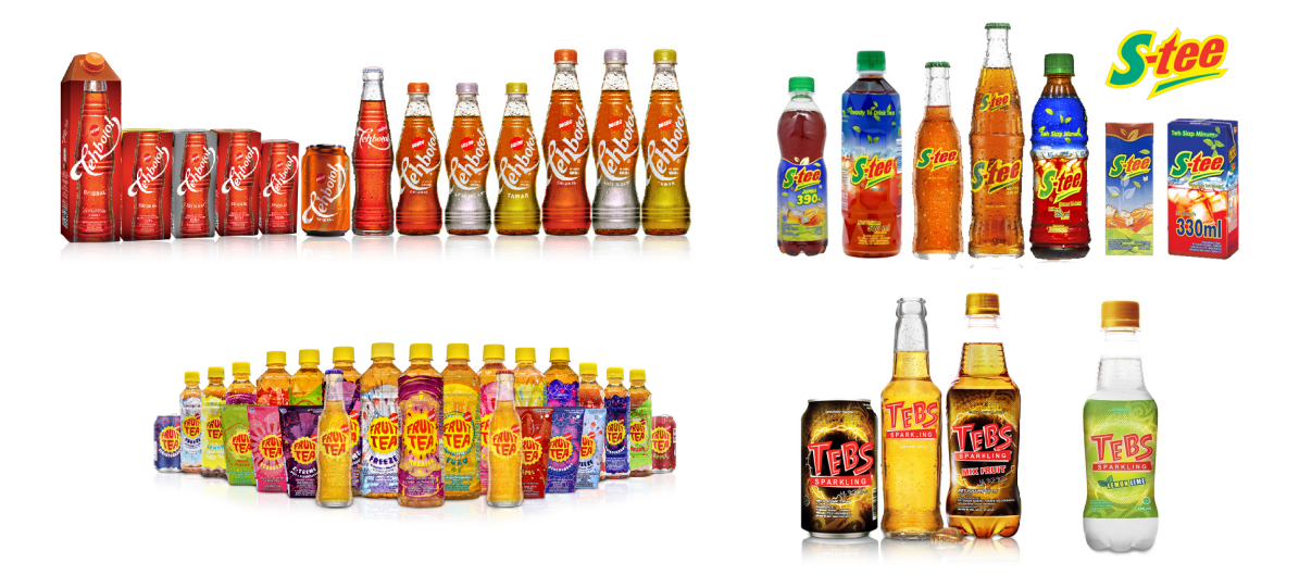
Figure 1. Tea-based Products namely Tehbotol Sosro, S-Tee, Fruit Tea, and Tebs

Aside from tea-based beverages, PT. Sinar Sosro also produces RTD fruit juice under the brand of Country Choice. It is available in four variants namely Apple, Guava, Orange, and Mango. Additionally, there are new variants of the product which is Country Choice Fit & Fresh. It is a combination of fruit, vegetables, and herbs. The variants include Guardian Red, Optimist Orange, and Purify Green. The last product of PT. Sinar Sosro is Prim-A Mineral Water. It is available in a wide range of packaging, including cup, PET, and gallon packaging.