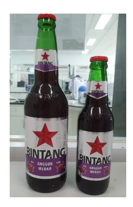
Figure 5. Bintang anggur merah beer