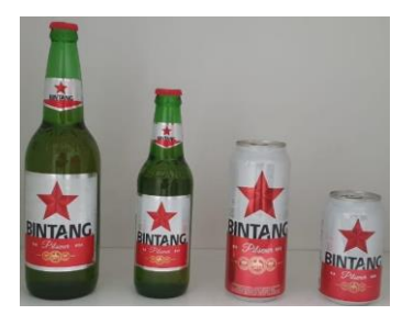
Figure 1. Bintang beer

PT Multi Bintang Indonesia Tbk has two brewery that located in Tangerang and Sampang Agung (PT Multi Bintang Indonesia, 2021). In Tangerang Brewery they not only focus on producing Beer Bintang, they produce Heineken, Radler, Bintang Anggur Merah, and Beer Crystal in various types of packaging and variants. Bintang Beer (Figure 1) is a pilsner beer that produced by PT Multi Bintang Indonesia as their most famous products. It is packaged in green bottle glass that comes in two different sizes 620 ml (Bremer) and 330 ml (Pint). Other than that, there is also a product that is packaged in a Can that also comes in two different sizes (500 ml and 320 ml) (PT Multi Bintang Indonesia, 2021). Crystal Beer (Figure 2) is a new product that launched in 2021 as a lighter version of Beer Bintang. It is packed in a clear glass bottle in a Bremmer (620), Pint (330 ml) and Can (500 ml and 320 ml) (PT Multi Bintang Indonesia, 2021).