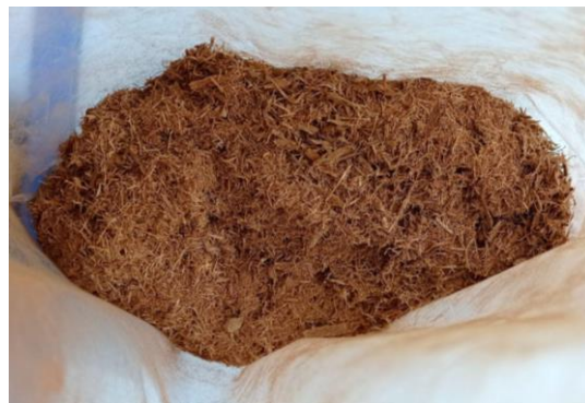
Fine powder of Kayu Kamlowelen