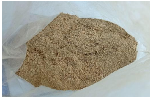
Fine powder of Kayu Bawang