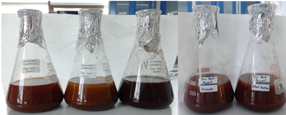
Maceration of Kayu Kamlowelen