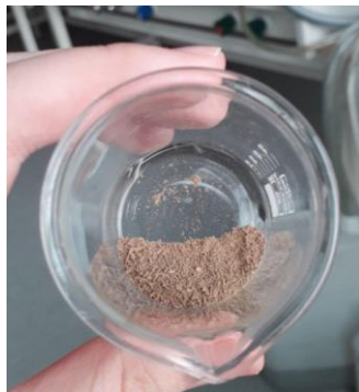
Extract of Kayu Bawang