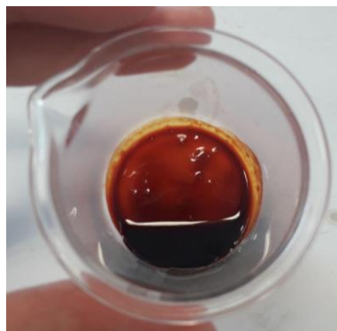
Extract of Kayu Kamlowelen