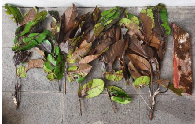
Stems and leaves of Kayu Kamlowelen