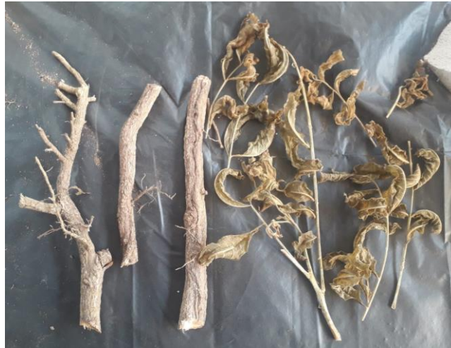
Stems and leaves of Kayu Bawang