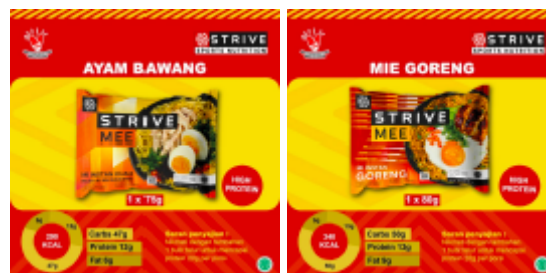
Figure 4. STRIVE instant noodles

Furthermore, STRIVE also collaborated with other companies to produce healthy instant noodles that is high in protein (1 serving consisted of 12 grams of protein). The noodles are not fried, using all natural ingredients, no MSG, making it healthier than other instant noodles varieties. This product was designed for people who wanted a quick easy protein meal. It has 2 flavors: Mie instan goreng and Mie instan kuah rasa ayam bawang.