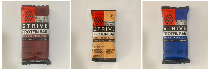
Figure 2. STRIVE protein bars

Because this is an up and coming company, the factory is not yet able to produce all of the products shown below. Hence why a collaboration is needed, the STRIVE Energy Gel and STRIVE MEE are outsourced from different companies. Even though the production of both of these products is not in PT. Nutrisi Harapan Bangsa, it has been made sure that the products are up to standard and is made exactly for its intended purpose. The STRIVE Energy Gel is made to give an energy boost during exercise and that is why it contains caffeine, BCAA, maltodextrin, electrolytes, dates, guarana, and ginger extract. The first ever flavor to be produced was pineapple. Now, the STRIVE Energy gel consists of 3 flavors which are pineapple, mango, and passion fruit.