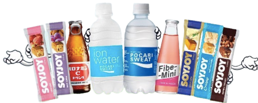
Figure 1. Products of PT Amerta Indah Otsuka

PT Amerta Indah Otsuka mainly sells healthy and innovative products to maintain and improve consumers' health. Products that Otsuka currently sells are Pocari Sweat, Ion Water, Soyjoy, Oronamin C, and Fibe-mini ( Figure 1 ).