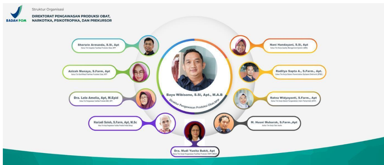
Figure 2. DITWASPROD ONPP structural organization

policies, standard procedures, conduct inspection to production facilities, and set criteria for technical guidance, supervision, and evaluation of drug, narcotics, psychotropics and precursors products. The scope of supervision by DITWASPROD ONPP is the pharmaceutical industry ( production of medicinal raw materials, finished medicines with chemical active substances, and local or imported biological products production facilities) and special facilities such as Blood Transfusion Units (BTU), research institutes, stem cell processing facilities, and radiopharmaceutical processing/production facilities.