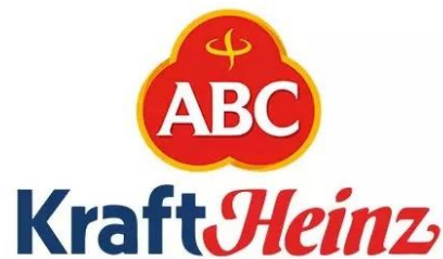
Figure 1. Logo of PT. Heinz ABC Indonesia