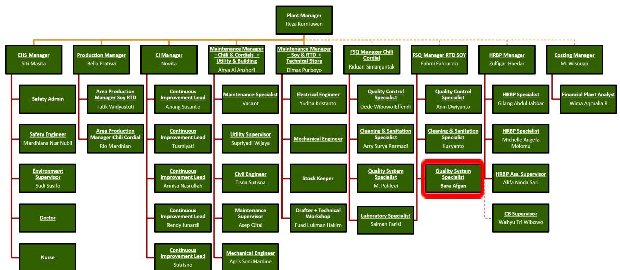
Figure 3. PT. Heinz ABC Indonesia's organizational structure

The organizational structure used by PT. Heinz ABC Indonesia is a line organization structure. This organizational structure shows that each subordinate is directly responsible for their respective leaders. Karawang Manufacturing is led by a plant manager who oversees the environment, health, and safety (EHS) manager, production manager, continuous improvement (CI) manager, maintenance manager, Food Safety and Quality (FSQ) manager, human resources business partner (HRBP), and costing manager. The diagram of the PT. Heinz ABC Indonesia's organizational structure can be seen in Figure 3.