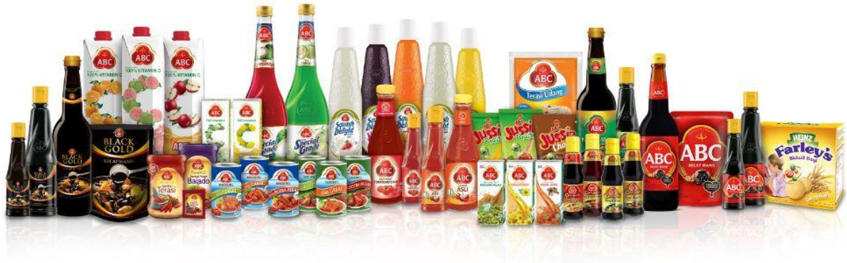
Figure 2. Product of PT. Heinz ABC Indonesia