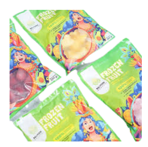
Figure.1 Frozen Fruit Product of PT Bali Food Industry

The lemon juice product is in PT Bali Food Industry known as "maha lemon" and is obtained through the process of extracting juice from lemons, incorporating Natrium benzoate as a preservative, subjecting the lemon juice to pasteurization, and subsequently cooling it. Once the lemon juice production process is complete, it is transferred into plastic bottles that have undergone sterilization using hot steam. Once the maha lemon has been filled, it requires labeling and subsequent storage at ambient temperature. Three different types of lemon juice can be identified: original, honey-infused, and ginger-infused. Prior to the process of pasteurization, supplementary ingredients would be integrated.