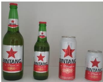
Figure 1. Bintang beer

PT Multi Bintang Indonesia Tbk has two brewery that located in Tangerang and Sampang Agung (PT Multi Bintang Indonesia, 2021). In Tangerang Brewery they not only focus on producing Beer Bintang, they produce Heineken, Radler, Bintang Anggur Merah, and Beer Crystal in various types of packaging and variants. Bintang Beer (Figure 1) is a pilsner beer that produced by PT Multi Bintang Indonesia as their most famous products. It is packaged in green bottle glass that comes in two different sizes 620 ml (Bremer) and 330 ml (Pint). Other than that, there is also a product that is packaged in a Can that also comes in two different sizes (500 ml and 320 ml) (PT Multi Bintang Indonesia, 2021). Crystal Beer (Figure 2) is a new product that launched in 2021 as a lighter version of Beer Bintang. It is packed in a clear glass bottle in a Bremmer (620), Pint (330 ml) and Can (500 ml and 320 ml) (PT Multi Bintang Indonesia, 2021).