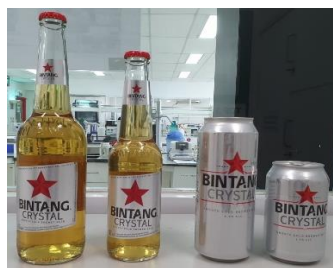
Figure 2. Crystal beer