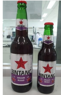
Figure 5. Bintang anggur merah beer