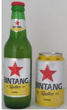
Figure 4. Bintang radler beer