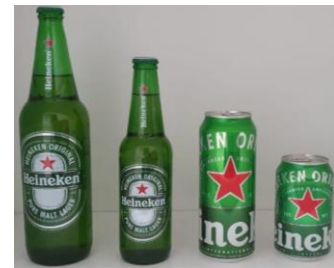
Figure 3. Heineken beer

Other than Bintang products, Heineken Beer (Figure 3) is also produced by PT Multi Bintang Indonesia. Heineken Beer is an international premium class beer that made from 100% premium malt. Heineken Beer is packaged in a green coloured glass bottle in a two different size named Quartz (640 ml) and Pint (330 ml), and also in a Can of 500 ml and 320 ml (PT Multi Bintang Indonesia, 2021). Bintang Radler (Figure 4) is a flavoured beer that uses a natural lemon flavouring compound that is packed in a green glass bottle and can with content of 330 ml (Pint) and 320 ml (Can) (PT Multi Bintang Indonesia, 2021). Bintang Anggur Merah (Figure 5) is a new product from PT Multi Bintang Indonesia that is launched in 2023 and has a grape flavor that is sweet but still has a bitter taste of the beer that packed in a green glass bottle with size of 620 ml (Bremmer) and 330 ml (Pint).